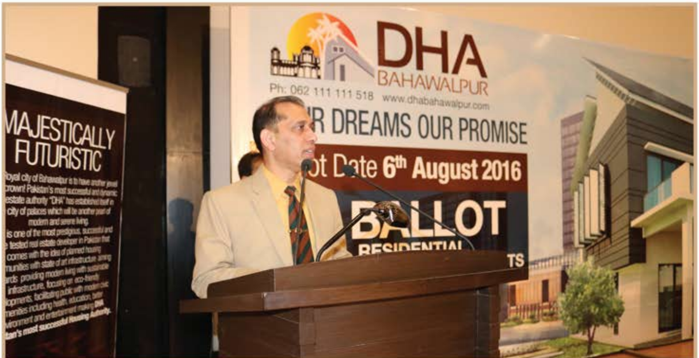
Project Director DHA Bahawalpur Addressing 2 nd Ballot Ceremony

The 2 nd ballot for 2 Kanal residential and 4 Marla commercial plots was held on 6 th August 2016. DHA Bahawalpur is setting new standards and achieving milestones as the development work is being carried out swiftly in compliance with the international structural and constructional standards.