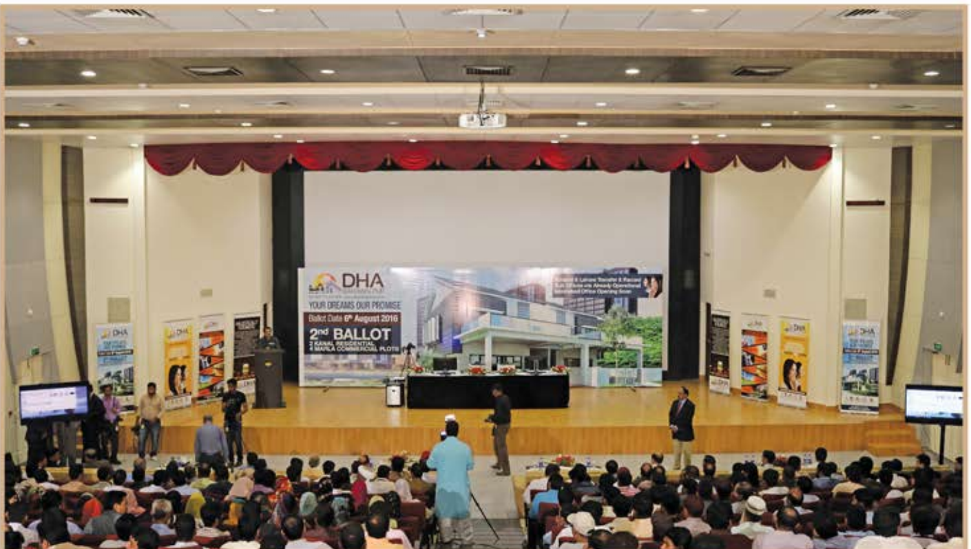
2 nd Ballot Ceremony