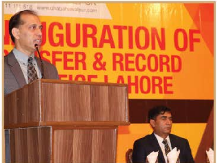
PD DHA Bahawalpur Addressing the Ceremony