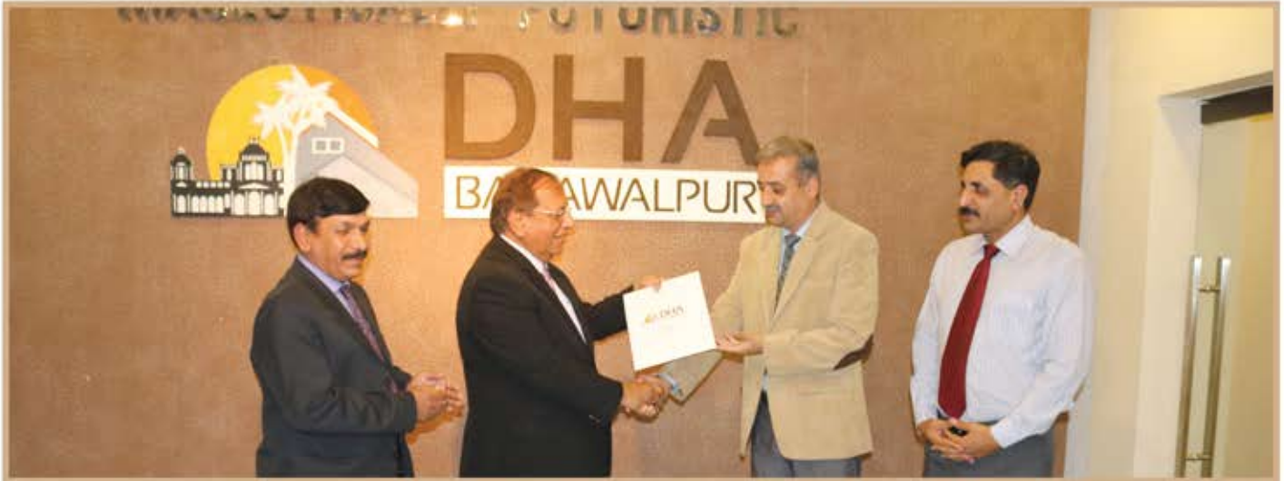
Secretary DHA Bahawalpur & COO of HRL At Contract Signing Ceremony