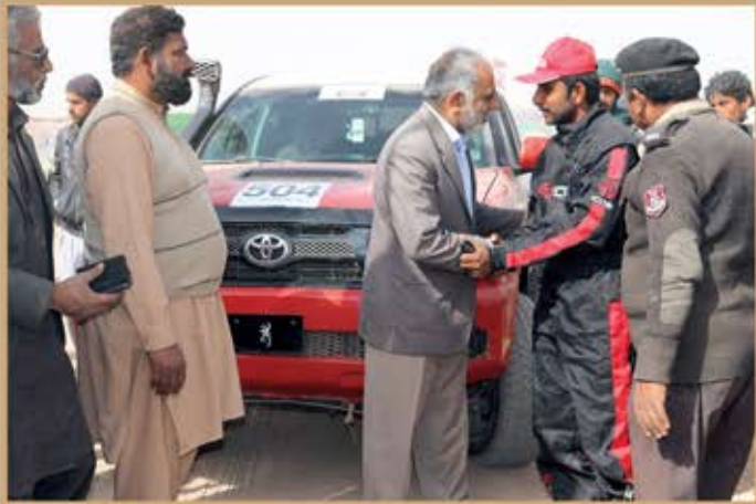
Dir Admin DHA Bahawalpur Wishing the Participants