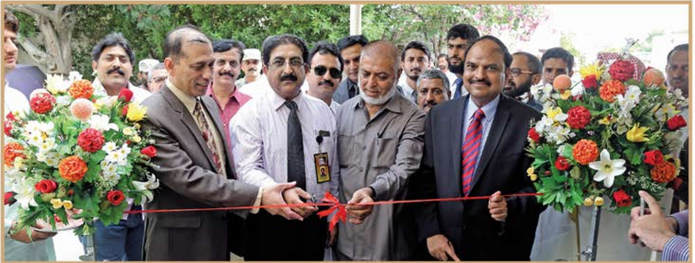
Chief Guest, Vice President Karachi Property Dealers Association Inaugurating Karachi Sub Office