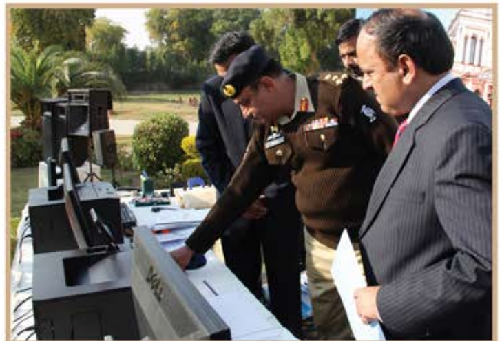
An Army Officer Clicks for Ballot