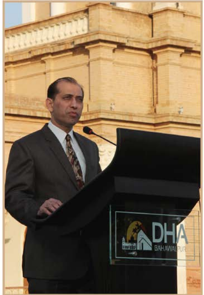
PD DHA Bahawalpur Addressing Ballot Ceremony