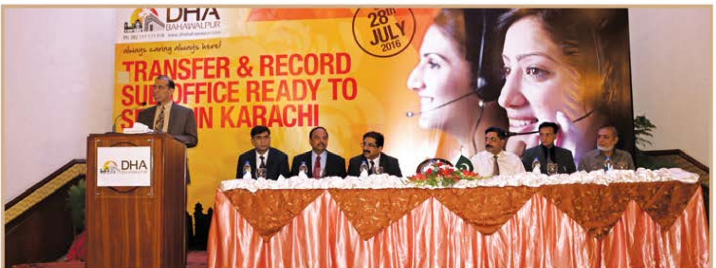
PD DHA Bahawalpur Addressing the Ceremony