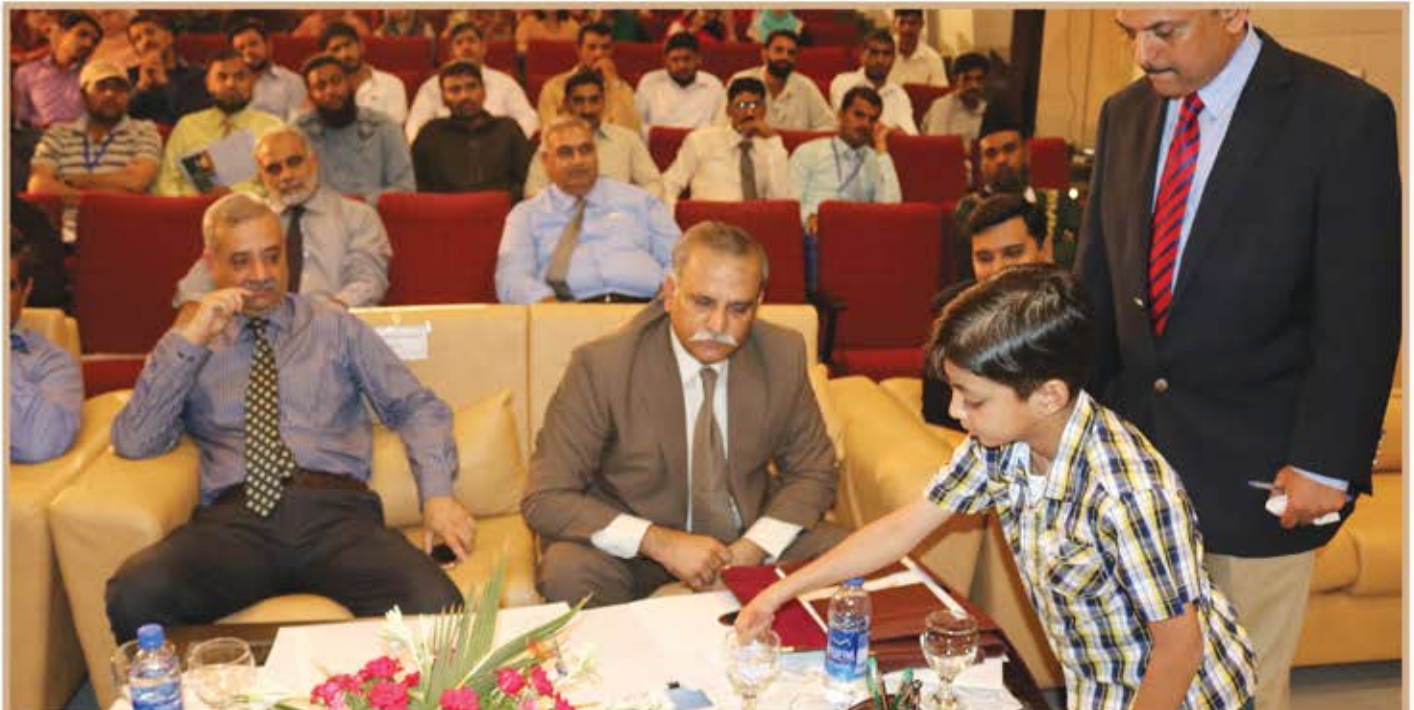
Balloting Committee Supervising Ballot Process