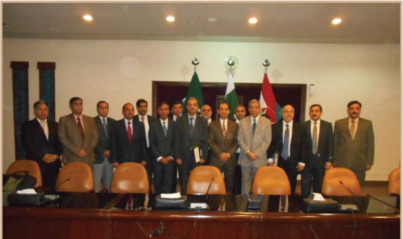
Senior Management of DHA Bahawalpur & ProMag at the Contract Signing Ceremony

This mini-city at Bahawalpur shall be further complemented with an 18-hole golf course and a theme park. While seeking to embrace the city's cultural heritage and endorsing its prestigious identity as a City of Knowledge, DHA Bahawalpur's master plan also incorporates dedicated areas for schools and colleges as well as a specific enclave purely earmarked for universities and other institutions of higher education.