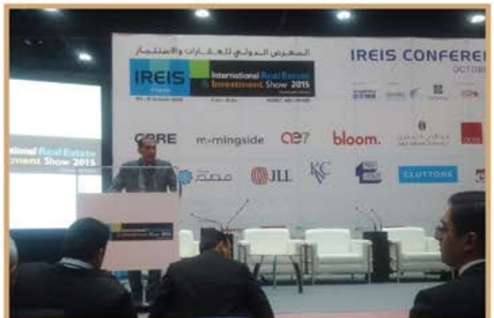
PD DHA Bahawalpur, addressing IREIS Conference