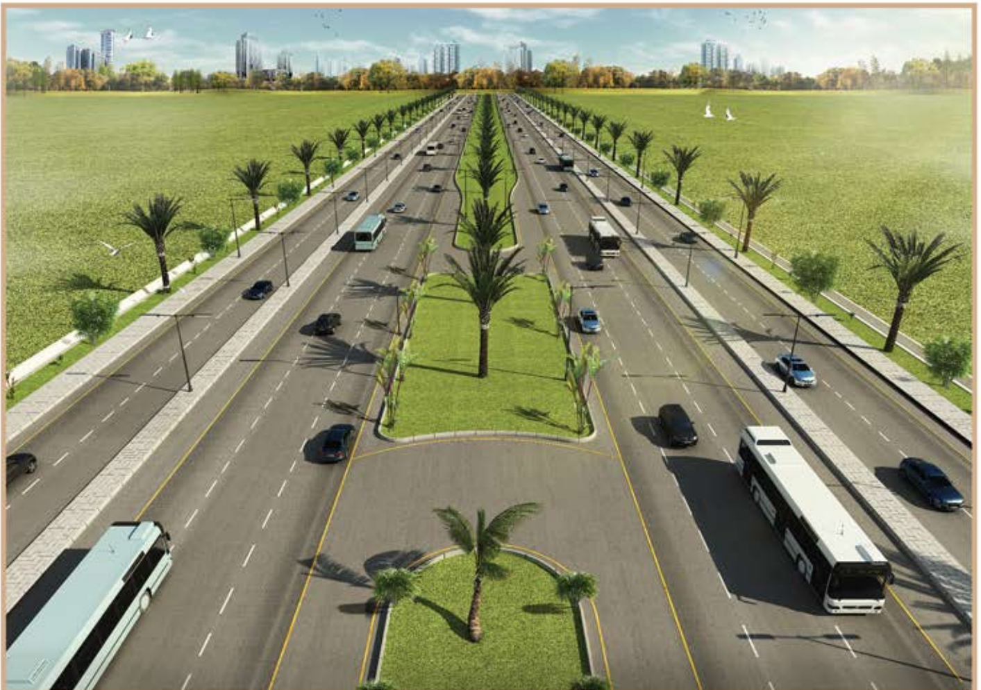
Original Main Boulevard Design