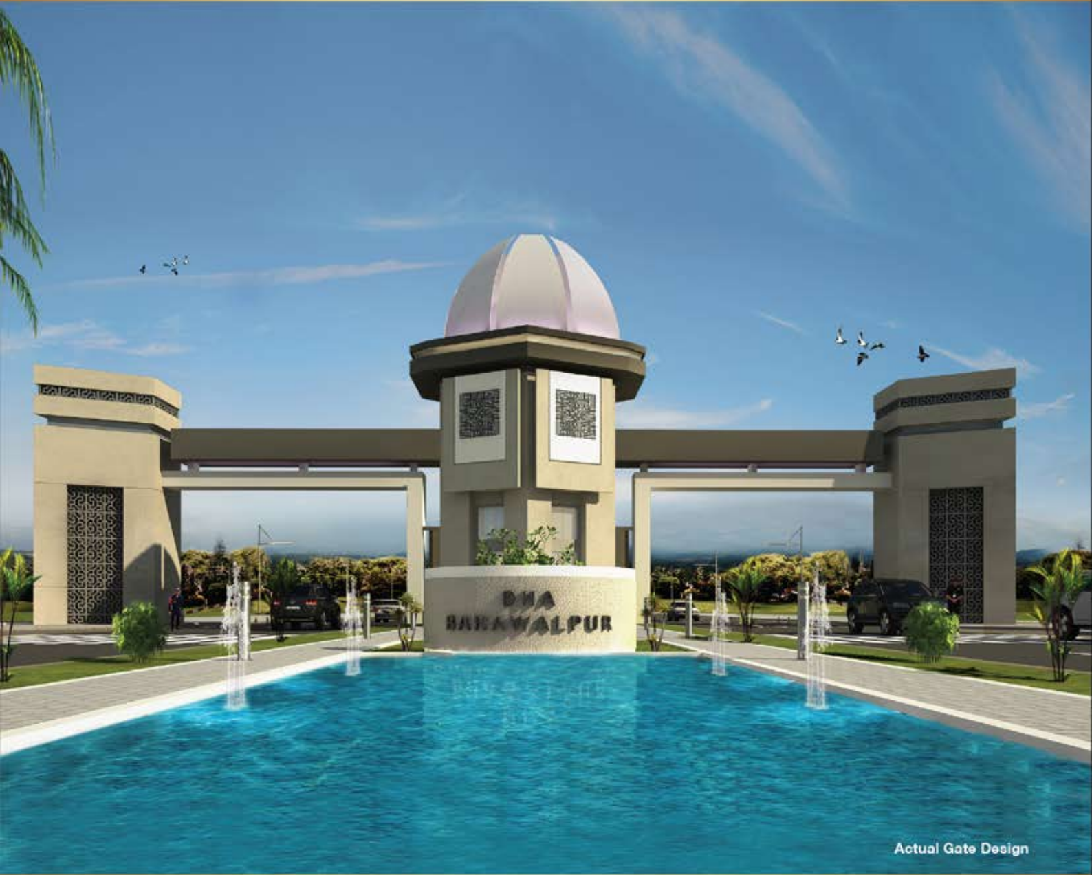
Actual Gate Design