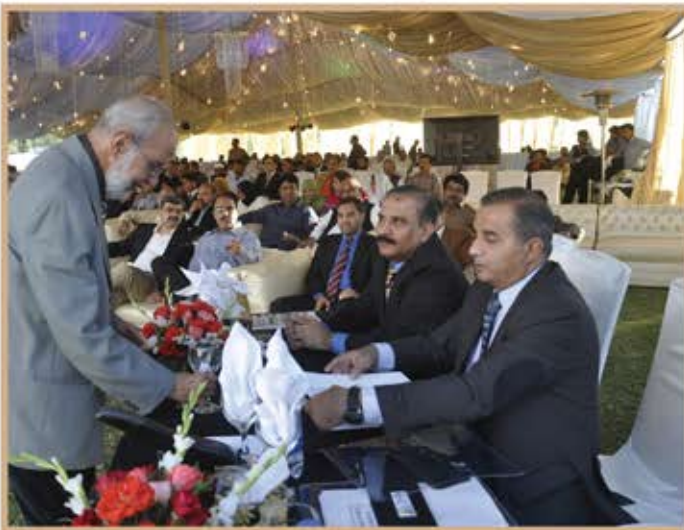
Senior Citizen Participating in Ballot Process