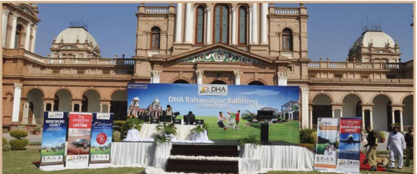
Historical First Ballot Ceremony at Noor Mahal