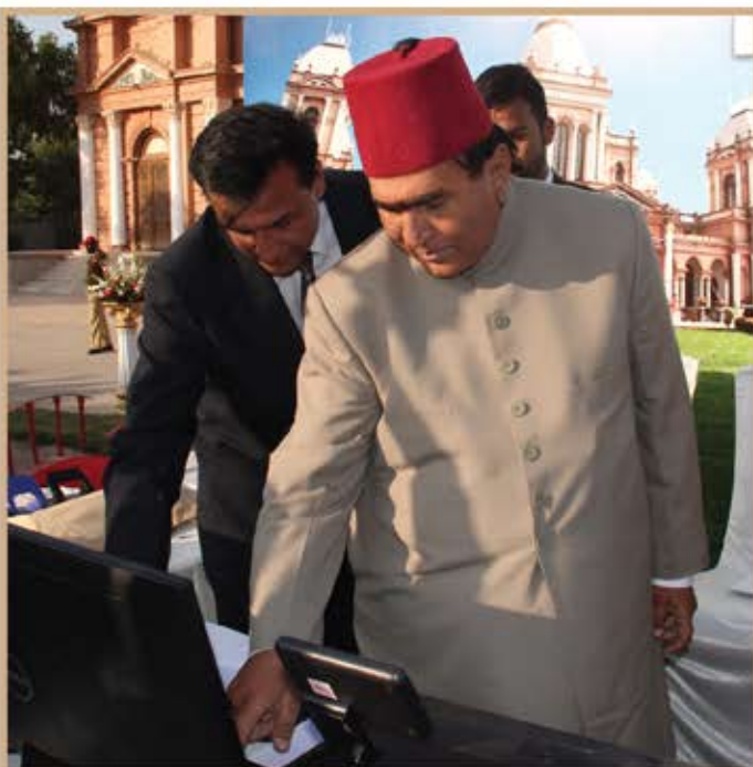
Prince Qamar Uz Zaman Abbasi Clicks for Ballot