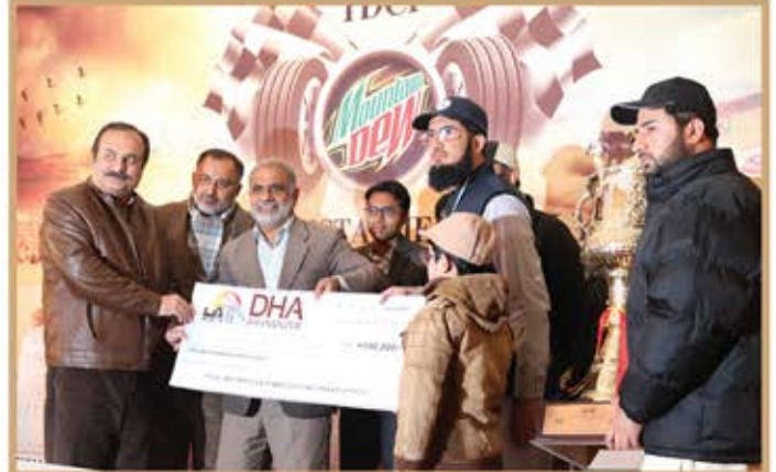
Chief Guest, Education Minister Punjab and Dir Admin DHA Bahawalpur Distributing Prize Money to the Winner of Jeep Rally