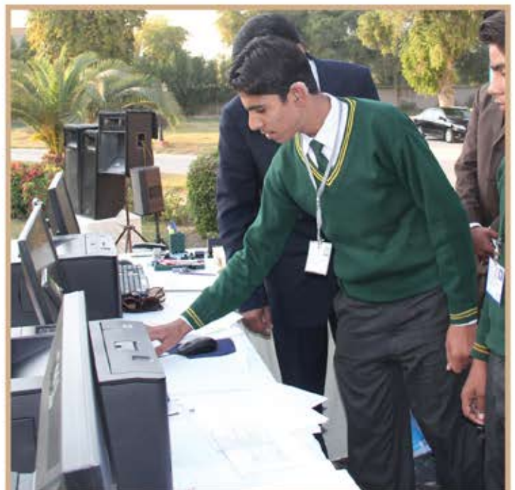
An APS student Clicks for Ballot