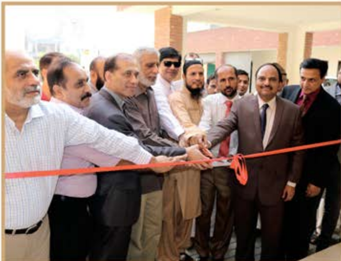
Chief Guest, President Lahore Property Dealers Association Inaugurating Lahore Sub Office