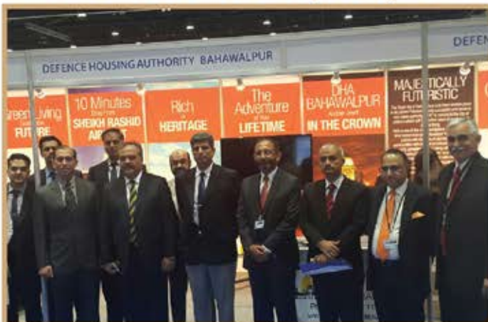
PD DHA Bahawalpur, with Pakistani Ambassador at UAE